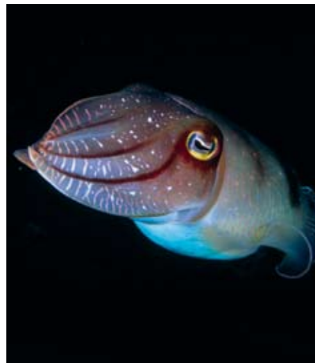
Sepia latimanus achieves its exotic look by the clever arrangement of iridescent cells in its skin

Sciences , vol 104, p 14372). As Langridge points out, most people would assume there is a big gulf in cognitive capacity between mammals and cuttlefish. “Discriminating between species and applying different tactics to different ones is pretty sophisticated for a mollusc,” she says.